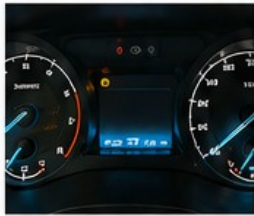
ODOMETER: 120,000 KM