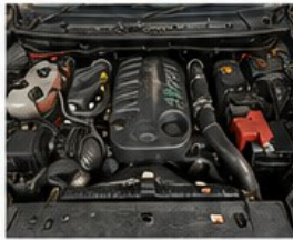
3.2L 5 CYL TURBO DIESEL