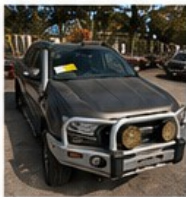
FRONT RIGHT VIEW