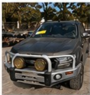
FRONT LEFT VIEW